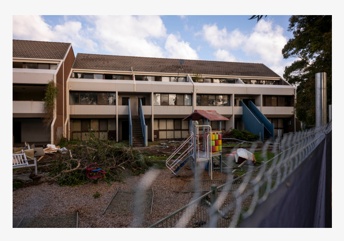
Photo of demolition Barak Beacon public housing Melbourne.